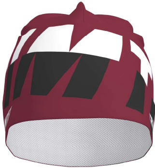
B56-L BI-ELASTIC CAP

NB!: some models not 100% correct due to beta version